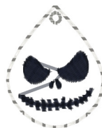
Jack Earrings.vp3 3.50x3.48 inches; 1,870 stitches 6 thread changes; 5 colors