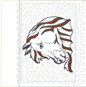
Horse Front Part V6.pes

7.81x7.83 inches; 11,619 stitches 8 thread changes; 7 colors