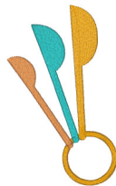
Measuring Spoons Only 3x5.vip

3.80x2.30 inches; 3,796 stitches 3 thread changes; 3 colors