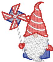
Fsl Independence Day Gnomes 01.vip 3.30x3.91 inches; 11,599 stitches 7 thread changes; 4 colors