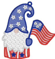
Fsl Independence Day Gnomes 02.vip 3.66x3.93 inches; 12,359 stitches 6 thread changes; 4 colors