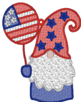
Fsl Independence Day Gnomes 04.vip 3.08x3.88 inches; 11,179 stitches 6 thread changes; 4 colors