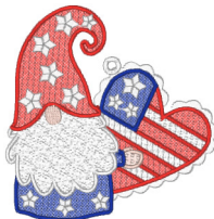
Fsl Independence Day Gnomes 05.vip 3.85x3.91 inches; 13,663 stitches 8 thread changes; 4 colors