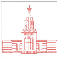
Accra Ghana - 7in.vip

6.30x6.30 inches; 3,813 stitches 2 thread changes; 2 colors