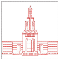
Accra Ghana - 8in.vip

7.09x7.09 inches; 4,154 stitches 2 thread changes; 2 colors