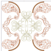
Paisley Block 4 8x8.vip

6.81x6.80 inches; 10,900 stitches 5 thread changes; 5 colors