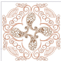
Paisley Block 2 8x8.vip

6.81x6.80 inches; 11,843 stitches 4 thread changes; 4 colors