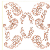
Paisley Block 5 7x7.vip

7.85x7.83 inches; 11,337 stitches 5 thread changes; 5 colors