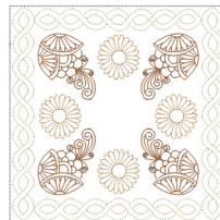
Paisley Block 3 8x8.vip

6.81x6.80 inches; 9,639 stitches 5 thread changes; 5 colors