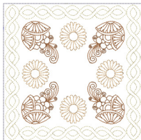
Paisley Block 3 7x7.vip

7.83x7.81 inches; 13,016 stitches 4 thread changes; 4 colors