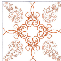
Paisley Block 6 8x8.vip

6.81x6.80 inches; 9,790 stitches 4 thread changes; 4 colors