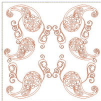
Paisley Block 5 8x8.vip

6.85x6.84 inches; 11,397 stitches 3 thread changes; 3 colors