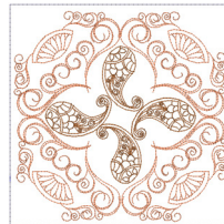
Paisley Block 2 7x7.vip

7.82x7.80 inches; 10,500 stitches 3 thread changes; 3 colors