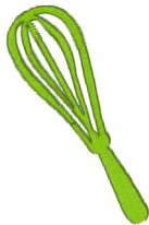
Whisk Only 2x2.vip

1.53x2.34 inches; 1,381 stitches 1 thread changes; 1 colors