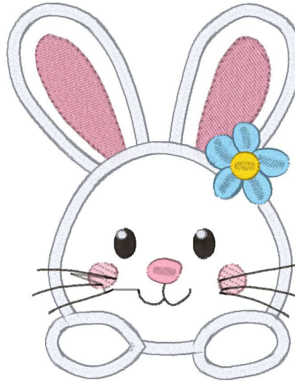
Design 2.vip 4.02x5.16 inches; 9,447 stitches 8 thread changes; 7 colors