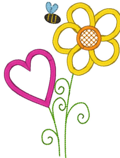
Design 5.vip 3.93x5.19 inches; 5,969 stitches 11 thread changes; 8 colors