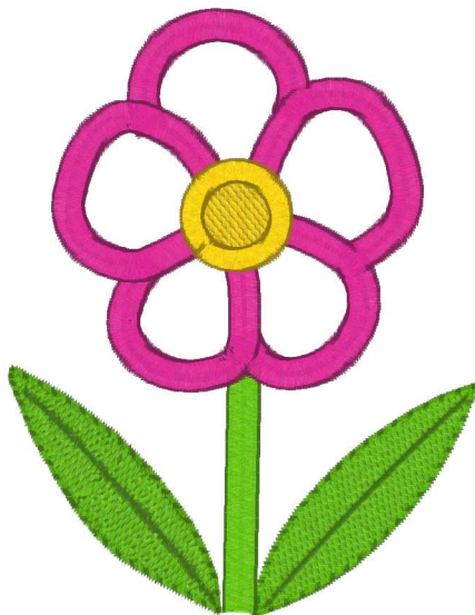
Design 4.vip 2.61x3.40 inches; 5,087 stitches 5 thread changes; 5 colors