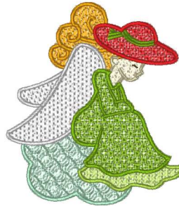
Fsl Red Hat Angel 7.vip

3.50x3.85 inches; 15,158 stitches 7 thread changes; 7 colors