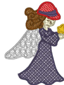
Fsl Red Hat Angel 5.vip 2.83x3.81 inches; 14,219 stitches 9 thread changes; 7 colors