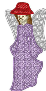
Fsl Red Hat Angel 2.vip 1.92x3.87 inches; 10,795 stitches 6 thread changes; 5 colors