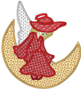
Fsl Red Hat Angel 6.vip

3.50x3.85 inches; 15,158 stitches 7 thread changes; 7 colors