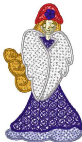
Fsl Red Hat Angel 1.vip 2.09x3.72 inches; 12,217 stitches 9 thread changes; 7 colors