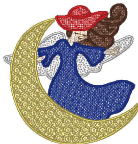
Fsl Red Hat Angel 10.vip 3.76x3.89 inches; 23,849 stitches 8 thread changes; 7 colors