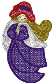
Fsl Red Hat Angel 3.vip 2.34x3.86 inches; 15,069 stitches 9 thread changes; 6 colors