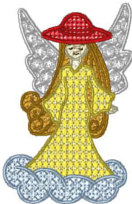
Fsl Red Hat Angel 9.vip

2.38x3.86 inches; 11,427 stitches 9 thread changes; 7 colors