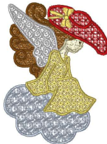
Fsl Red Hat Angel 4.vip 2.81x3.79 inches; 17,570 stitches 8 thread changes; 7 colors