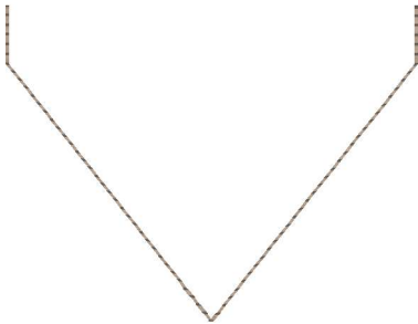
Back Fabric Tack Down.vp3 3.90x3.00 inches; 233 stitches 1 thread changes; 1 colors