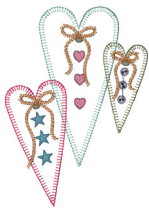
Heart Trio 3.vip

4.08x5.73 inches; 7,286 stitches 15 thread changes; 13 colors