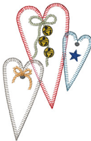
Heart Trio 1.vip

1.87x3.81 inches; 4,483 stitches 10 thread changes; 6 colors