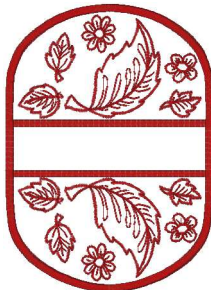
Micro Mitt 4.vip

5.05x7.01 inches; 12,992 stitches 7 thread changes; 3 colors