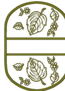
Micro Mitt 6.vip

5.05x7.01 inches; 12,765 stitches 7 thread changes; 3 colors