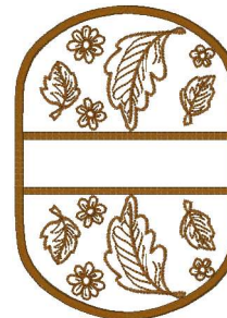
Micro Mitt 3.vip

5.05x7.01 inches; 12,145 stitches 7 thread changes; 3 colors