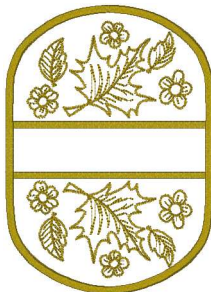
Micro Mitt 1.vip

5.05x7.01 inches; 12,735 stitches 7 thread changes; 3 colors