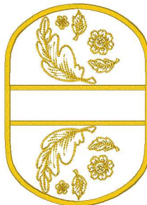
Micro Mitt 2.vip

5.05x7.01 inches; 12,735 stitches 7 thread changes; 3 colors