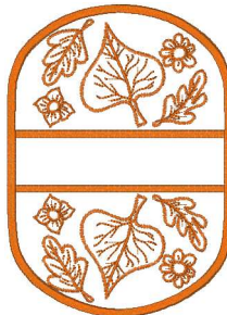
Micro Mitt 5.vip

5.05x7.01 inches; 12,895 stitches 7 thread changes; 3 colors