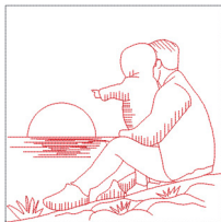
Dad And Son Watching Sun-7in.vp3 6.89x6.89 inches; 3,230 stitches 2 thread changes; 2 colors