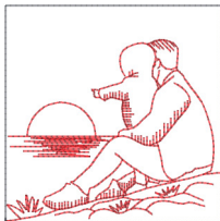
Dad And Son Watching Sun-4in.vp3 3.86x3.86 inches; 1,983 stitches 2 thread changes; 2 colors