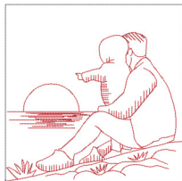
Dad And Son Watching Sun-6in.vp3 6.22x6.22 inches; 2,933 stitches 2 thread changes; 2 colors