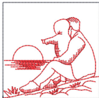
Dad And Son Watching Sun-3in.vp3 2.95x2.95 inches; 1,588 stitches 2 thread changes; 2 colors