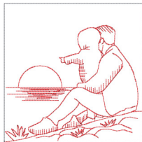
Dad And Son Watching Sun-5in.vp3 5.04x5.04 inches; 2,447 stitches 2 thread changes; 2 colors