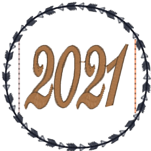
2021 Scarf Cuff Circle 4x4.vp3 2.86x2.87 inches; 3,495 stitches 6 thread changes; 4 colors