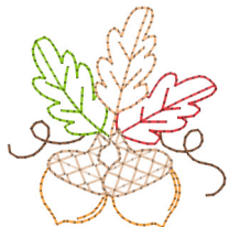
Acorn Pair Vintage Stitch 3 Inch.vip 2.96x3.00 inches; 1,837 stitches 6 thread changes; 6 colors