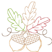
Acorn Pair Vintage Stitch 5 Inch.vip 4.94x5.00 inches; 2,872 stitches 6 thread changes; 6 colors