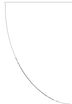
Pattern For Backing Print 2.vip

7.84x10.81 inches; 4,863 stitches 13 thread changes; 3 colors