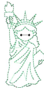
Baby Liberty Line Raggy 95.vp3 1.81x3.74 inches; 2,178 stitches 4 thread changes; 4 colors