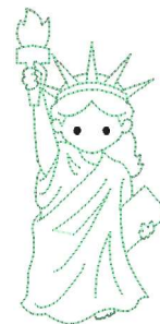
Baby Liberty Line Raggy 170.vp3 3.24x6.69 inches; 3,373 stitches 4 thread changes; 4 colors