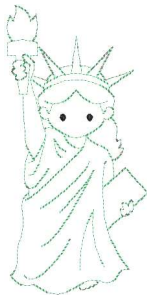
Baby Liberty Line Raggy 195.vp3 3.72x7.68 inches; 3,744 stitches 4 thread changes; 4 colors