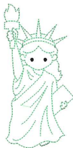
Baby Liberty Line Raggy 145.vp3 2.76x5.71 inches; 2,976 stitches 4 thread changes; 4 colors