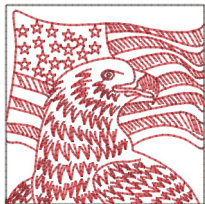
Independence Day American Eagle-3in.vp3 2.95x2.94 inches; 4,492 stitches 2 thread changes; 2 colors