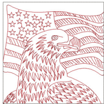
Independence Day American Eagle-6in.vp3 6.22x6.20 inches; 7,677 stitches 2 thread changes; 2 colors