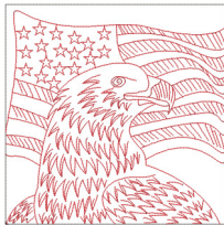
Independence Day American Eagle-7in.vp3 6.89x6.87 inches; 8,212 stitches 2 thread changes; 2 colors