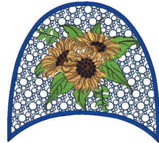
Top Left 7_tomin.vip 7.51x6.90 inches; 44,918 stitches 9 thread changes; 8 colors