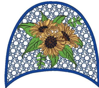
Top Right 7_tomin.vip 7.51x6.90 inches; 44,918 stitches 9 thread changes; 8 colors