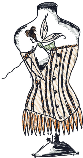
Sewing Lingerie Fairy Cindy 5x7.vip

3.58x6.90 inches; 21,104 stitches 8 thread changes; 8 colors