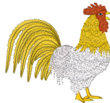
Country Chicken 9.vip

3.83x3.46 inches; 10,372 stitches 9 thread changes; 7 colors