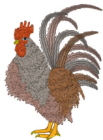
Country Chicken 10.vip

2.76x3.85 inches; 9,936 stitches 9 thread changes; 9 colors