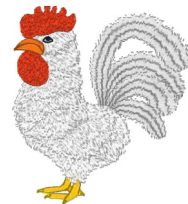
Country Chicken 12.vip

3.64x3.82 inches; 9,468 stitches 10 thread changes; 8 colors