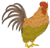
Country Chicken 7.vip

3.42x3.84 inches; 10,431 stitches 7 thread changes; 7 colors