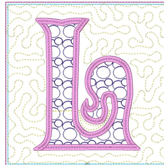
L Block 6x6.vip 6.00x6.00 inches; 13,321 stitches 8 thread changes; 6 colors