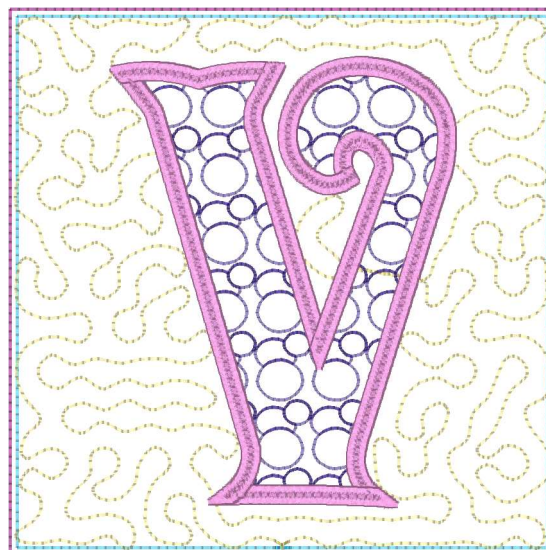
V Block 6x6.vip 6.00x6.00 inches; 12,070 stitches 8 thread changes; 6 colors