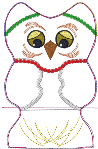
Cm Owl 2.vip

5.08x6.84 inches; 10,538 stitches 22 thread changes; 12 colors