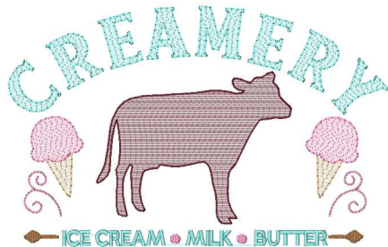
Creamery Sketch.vp3 6.98x4.40 inches; 9,545 stitches 6 thread changes; 5 colors