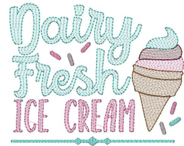
Dairy Fresh Sketch.vp3 5.57x4.57 inches; 11,292 stitches 5 thread changes; 5 colors