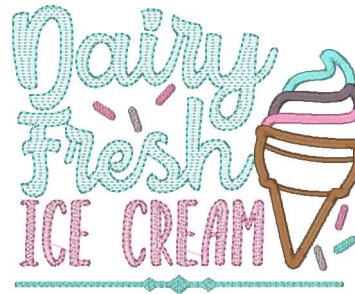
Dairy Fresh Applique.vp3 5.65x4.57 inches; 12,658 stitches 13 thread changes; 7 colors