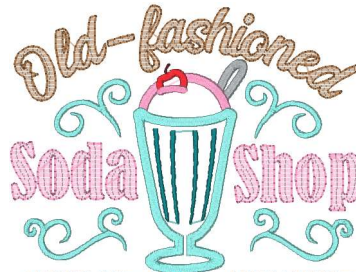
SHAVED ICE • MALTS • MILK SHAKES Old Fashioned Applique.vp3 6.13x5.01 inches; 19,176 stitches 17 thread changes; 8 colors