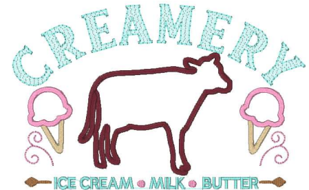
Creamery Applique.vp3 6.97x4.40 inches; 12,162 stitches 11 thread changes; 7 colors