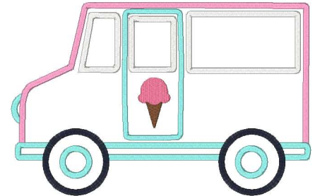
Ice Cream Truck Applique.vp3 7.06x4.56 inches; 11,478 stitches 18 thread changes; 8 colors