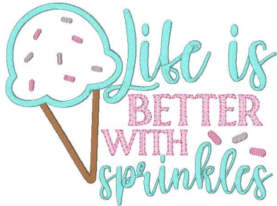
Better With Sprinkles Applique.vp3 6.79x5.07 inches; 13,304 stitches 8 thread changes; 6 colors