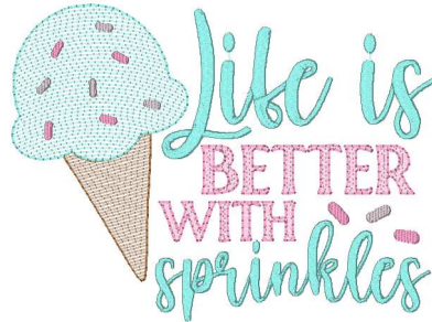
Better With Sprinkles Sketch.vp3 6.71x4.99 inches; 12,498 stitches 4 thread changes; 4 colors