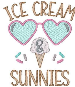
Ice Cream Sunnies Sketch.vp3 5.01x5.86 inches; 12,300 stitches 6 thread changes; 5 colors