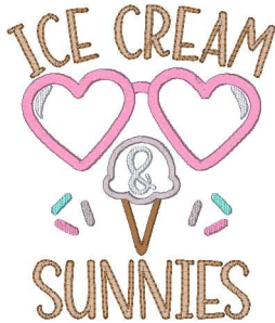
Ice Cream Sunnies Applique.vp3 5.01x5.86 inches; 12,311 stitches 12 thread changes; 7 colors