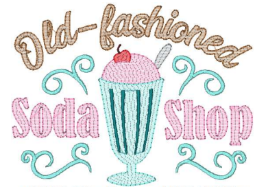
SHAVED ICE • MALTS • MILK SHAKES Old Fashioned Sketch.vp3 6.13x5.01 inches; 18,114 stitches 9 thread changes; 7 colors