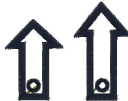
Bear Clock Arms.vip

1.76x1.28 inches; 1,314 stitches 6 thread changes; 3 colors