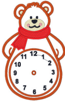
Bear Clock - 5x7.vip

4.47x6.98 inches; 15,081 stitches 12 thread changes; 7 colors