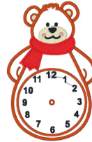
Bear Clock - 6x8.vip

4.47x6.98 inches; 15,081 stitches 12 thread changes; 7 colors