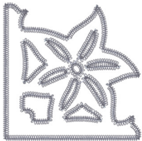
Tiger Lily 4.vip

4.74x4.77 inches; 9,281 stitches 3 thread changes; 3 colors