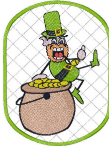
Potholder 02 - 6x8.vip 5.89x7.86 inches; 29,238 stitches 14 thread changes; 10 colors