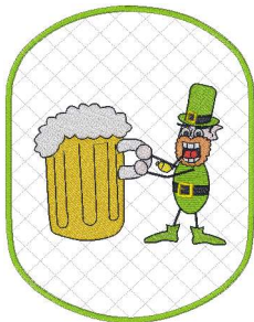
Potholders 04 - 8x10.vip 7.81x9.99 inches; 33,863 stitches 15 thread changes; 10 colors