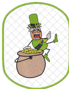
Potholders 02 - 8x10.vip 7.73x9.91 inches; 34,877 stitches 14 thread changes; 9 colors