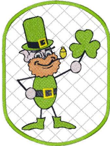
Potholder 01 - 6x8.vip 5.89x7.86 inches; 24,890 stitches 13 thread changes; 8 colors