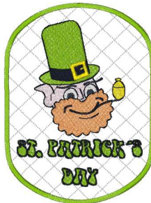
Potholder 05 - 6x8.vip 5.89x7.86 inches; 30,583 stitches 13 thread changes; 8 colors