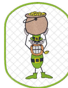
Potholders 03 - 8x10.vip 7.81x9.99 inches; 32,434 stitches 13 thread changes; 9 colors