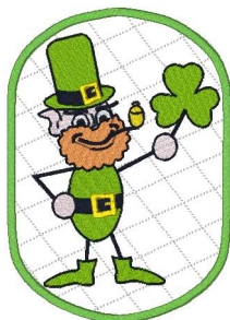
Potholders 01 - 5x7.vip

4.96x6.97 inches; 21,224 stitches 13 thread changes; 9 colors