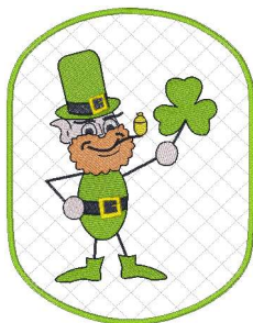
Potholders 01 - 8x10.vip 7.73x9.91 inches; 32,772 stitches 13 thread changes; 7 colors