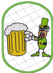
Potholders 04 - 5x7.vip

4.96x6.97 inches; 20,995 stitches 13 thread changes; 10 colors