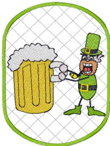
Potholder 04 - 6x8.vip 5.89x7.86 inches; 26,702 stitches 15 thread changes; 10 colors