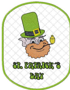
Potholders 05 - 8x10.vip 7.81x9.99 inches; 37,789 stitches 13 thread changes; 8 colors