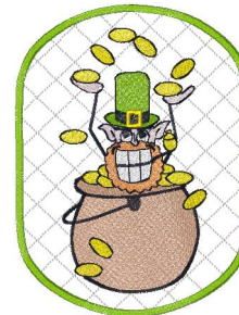
Potholder 06 - 6x8.vip 5.89x7.86 inches; 29,525 stitches 13 thread changes; 9 colors