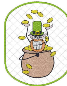
Potholders 06 - 8x10.vip 7.81x9.99 inches; 40,583 stitches 13 thread changes; 9 colors