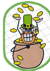
Potholders 06 - 5x7.vip

4.96x6.97 inches; 23,116 stitches 13 thread changes; 9 colors