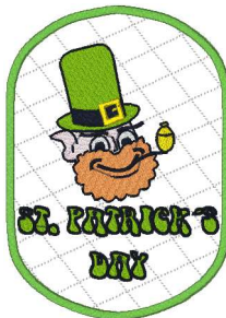
Potholders 05 - 5x7.vip

4.96x6.97 inches; 20,680 stitches 15 thread changes; 11 colors