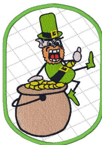
Potholders 02 - 5x7.vip

4.96x6.97 inches; 21,224 stitches 13 thread changes; 9 colors