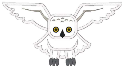
Flying Owl 195.vp3

6.69x3.54 inches; 8,466 stitches 7 thread changes; 7 colors