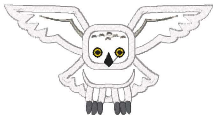
Flying Owl 120.vp3

4.72x2.48 inches; 5,834 stitches 7 thread changes; 7 colors