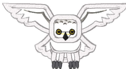
Flying Owl 95.vp3

7.66x4.07 inches; 10,083 stitches 7 thread changes; 7 colors