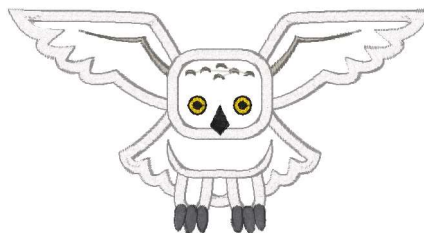
Flying Owl 145.vp3

4.72x2.48 inches; 5,834 stitches 7 thread changes; 7 colors