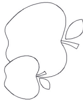
Two Apples - Bean - Ata - 5x7.vp3 4.85x5.93 inches; 2,267 stitches 15 thread changes; 3 colors