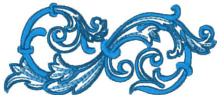
Baroque Pattern 4 Inch.vip 3.79x1.64 inches; 6,322 stitches 1 thread changes; 1 colors