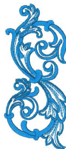
Baroque Pattern 5 Inch.vip 2.13x4.94 inches; 8,207 stitches 1 thread changes; 1 colors