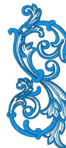
Baroque Pattern 7 Inch.vip 2.94x6.91 inches; 11,272 stitches 1 thread changes; 1 colors