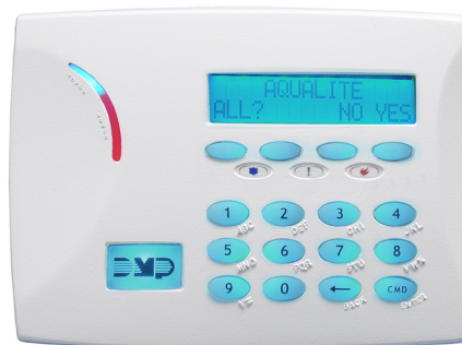
Blue Backlighting for Normal State