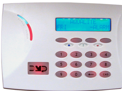
Red Backlighting for Alarm Conditions

In a normal state, both the keypad and logo backlighting remain Blue . However, during an alarm state, the keypad and logo turn Red . The change in color allows persons on-site to instantly recognize an alarm condition.