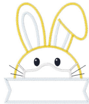
Bunny Wearing Mask - Zig Zag - Ata - 8x8.vip

5.84x6.85 inches; 6,198 stitches 18 thread changes; 5 colors