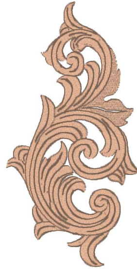
Baroque Swirl Pattern 04082024 5 Inch.vip 2.47x4.94 inches; 14,267 stitches 1 thread changes; 1 colors