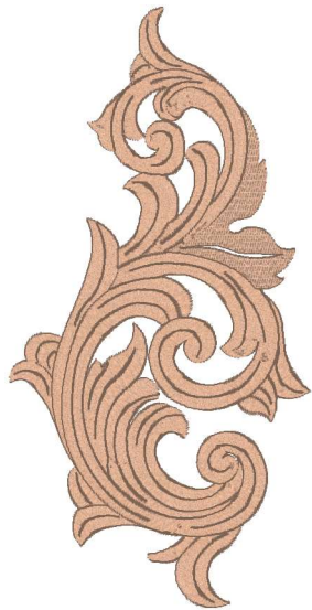
Baroque Swirl Pattern 04082024 8 Inch.vip 3.86x7.73 inches; 22,331 stitches 1 thread changes; 1 colors