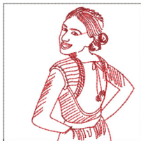
Girl With Backless Dress-4in.vp3 3.86x3.86 inches; 3,054 stitches 2 thread changes; 2 colors