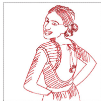
Girl With Backless Dress-5in.vp3 5.04x5.04 inches; 3,714 stitches 2 thread changes; 2 colors