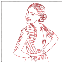
Girl With Backless Dress-6in.vp3 6.22x6.22 inches; 4,381 stitches 2 thread changes; 2 colors