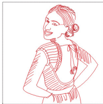
Girl With Backless Dress-7in.vp3 6.89x6.89 inches; 4,690 stitches 2 thread changes; 2 colors