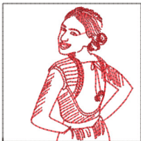
Girl With Backless Dress-3in.vp3 2.95x2.95 inches; 2,461 stitches 2 thread changes; 2 colors