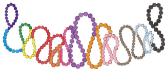
T1109c Bead Crown.vp3

7.73x3.20 inches; 6,386 stitches 13 thread changes; 13 colors