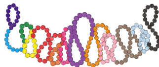
T1109b Bead Crown.vp3

5.98x2.51 inches; 4,697 stitches 13 thread changes; 13 colors