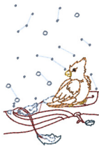
Colouline Winter Cardinals 1.vip 2.57x3.77 inches; 3,132 stitches 6 thread changes; 6 colors