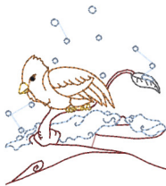
Colouline Winter Cardinals 10.vip 3.43x3.79 inches; 3,102 stitches 6 thread changes; 6 colors