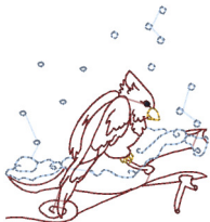
Colouline Winter Cardinals 3.vip 3.54x3.77 inches; 3,303 stitches 5 thread changes; 4 colors