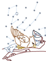
Colouline Winter Cardinals 5.vip 2.78x3.74 inches; 3,206 stitches 6 thread changes; 6 colors