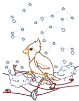
Colourline Winter Cardinals 7.vip 2.99x3.77 inches; 3,302 stitches 6 thread changes; 6 colors