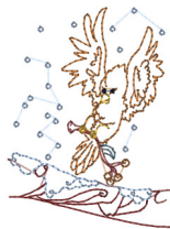
Colouline Winter Cardinals 2.vip 2.80x3.76 inches; 4,054 stitches 6 thread changes; 6 colors