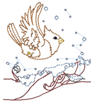
Colourline Winter Cardinals 9.vip 3.39x3.76 inches; 3,964 stitches 6 thread changes; 6 colors