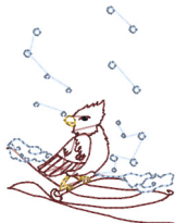
Colouline Winter Cardinals 4.vip 2.92x3.78 inches; 2,574 stitches 5 thread changes; 4 colors