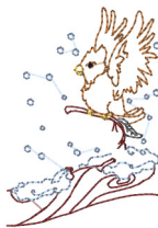
Colourline Winter Cardinals 8.vip 2.67x3.77 inches; 3,557 stitches 6 thread changes; 6 colors