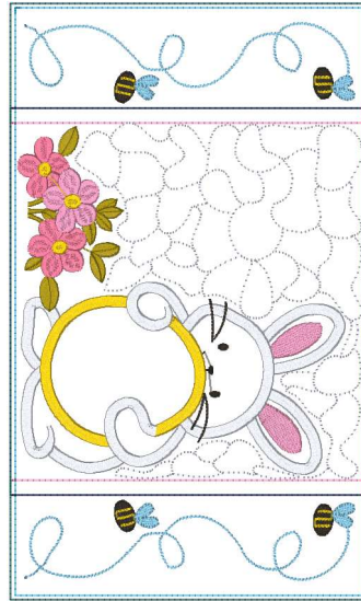
Design2.vip 6.00x10.00 inches; 19,906 stitches 25 thread changes; 11 colors