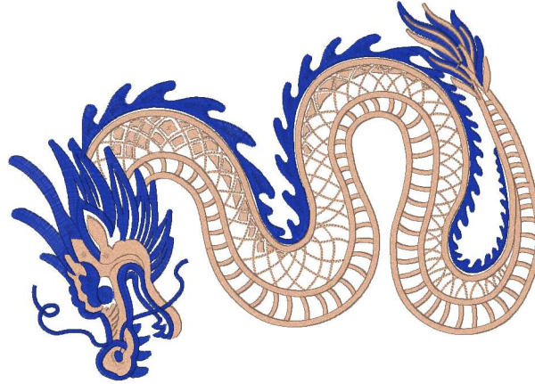
Classic Blue Gold Oriental Dragon 11 Inch.vip 10.83x7.69 inches; 55,993 stitches 3 thread changes; 2 colors