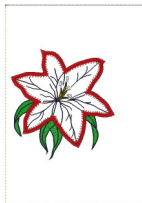
Main Part Lilly 140x200.vip

6.04x7.84 inches; 10,137 stitches 9 thread changes; 8 colors