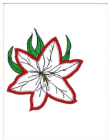
Main Part Lilly 6x8.vip

6.04x7.84 inches; 10,137 stitches 9 thread changes; 8 colors