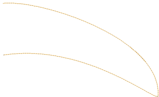
Spa-Otter Tail 6x10.hus

5.79x6.18 inches; 1,930 stitches 3 thread changes; 2 colors