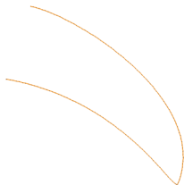
Spa-Otter Tail 8x8.hus

10.01x6.06 inches; 686 stitches 2 thread changes; 2 colors