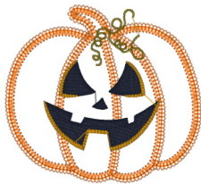
Jack O Lantern 2 - 1.vip

4.59x4.15 inches; 10,865 stitches 6 thread changes; 6 colors