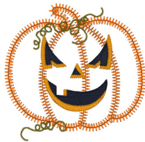
Jack O Lantern 2 - 3.vip

4.62x4.49 inches; 11,122 stitches 6 thread changes; 6 colors