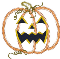
Jack O Lantern 2 - 2.vip

4.59x4.15 inches; 10,865 stitches 6 thread changes; 6 colors