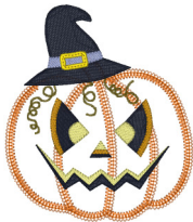
Jack O Lantern 2 - 4.vip

4.67x4.55 inches; 12,787 stitches 6 thread changes; 6 colors