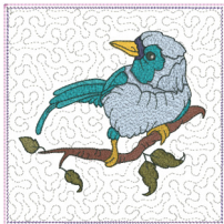
Bird-Centre-Block-6x10.vip 6.07x6.07 inches; 16,367 stitches 12 thread changes; 10 colors