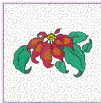
Poinsettia Middle-Bottom-Block-6x6.vip 6.07x6.07 inches; 15,444 stitches 10 thread changes; 9 colors