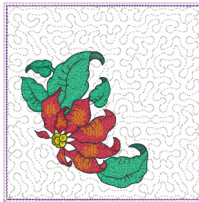
Poinsettia-Middle-Block-Corner-6x6.vip 6.07x6.07 inches; 15,444 stitches 10 thread changes; 9 colors