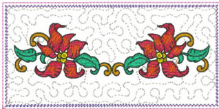
Poinsettia-Border-6x10.vip 6.07x2.95 inches; 10,673 stitches 10 thread changes; 9 colors