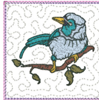
Sml-Corner-Block-4x4.vip 2.95x2.95 inches; 6,730 stitches 12 thread changes; 10 colors