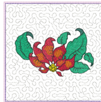
Poinsettia Middle-Top-Block-6x6.vip 6.07x6.07 inches; 15,455 stitches 10 thread changes; 9 colors