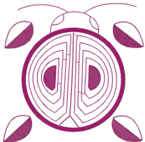
A Ladybug With The Lines On Back Applique-7in.vp3 6.91x6.80 inches; 10,878 stitches 4 thread changes; 4 colors