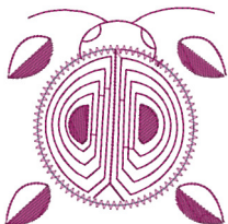
A Ladybug With The Lines On Back Applique-4in.vp3 3.87x3.82 inches; 4,144 stitches 3 thread changes; 3 colors