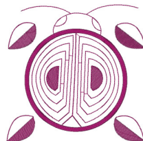
A Ladybug With The Lines On Back Applique-6in.vp3 6.24x6.15 inches; 9,560 stitches 4 thread changes; 4 colors