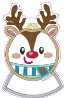
Cozy Christmas P2 Reindeer Ornament 5x7 Hbs.pes 3.78x5.90 inches; 14,392 stitches 20 thread changes; 16 colors