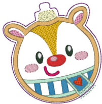
Cozy Christmas Reindeer Ornament 4x4 Hbs.pes 3.74x3.85 inches; 9,980 stitches 19 thread changes; 15 colors