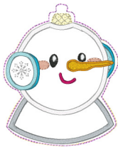
Cozy Christmas P2 Snowman Ornament 5x7 Hbs.pes 3.96x4.94 inches; 9,370 stitches 21 thread changes; 14 colors