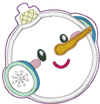
Cozy Christmas Snowman Ornament 4x4 Hbs.pes 3.50x3.65 inches; 7,752 stitches 18 thread changes; 11 colors