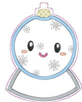
Cozy Christmas P2 Snowflake Ornament 5x7 Hbs.pes 3.83x5.03 inches; 7,870 stitches 14 thread changes; 12 colors