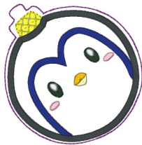
Cozy Christmas Penguin Ornament 4x4 Hbs.pes 3.40x3.46 inches; 5,757 stitches 14 thread changes; 11 colors