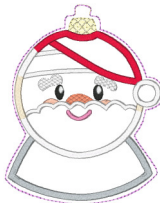
Cozy Christmas P2 Santa Ornament 5x7 Hbs.pes 4.00x5.03 inches; 9,437 stitches 25 thread changes; 13 colors