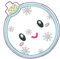
Cozy Christmas Snowflake Ornament 4x4 Hbs.pes 3.40x3.46 inches; 6,184 stitches 10 thread changes; 9 colors