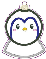
Cozy Christmas P2 Penguin Ornament 5x7 Hbs.vip 3.92x5.03 inches; 7,341 stitches 17 thread changes; 11 colors