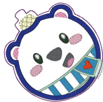
Cozy Christmas Polar Bear Ornament 4x4 Hbs.pes 3.76x3.69 inches; 8,297 stitches 15 thread changes; 12 colors