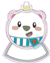
Cozy Christmas P2 Polar Bear Ornament 5x7 Hbs.pes 3.89x4.98 inches; 10,000 stitches 19 thread changes; 14 colors