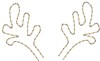
Cozy Christmas Antlers 4x4 Hbs.pes 3.19x1.95 inches; 668 stitches 2 thread changes; 2 colors