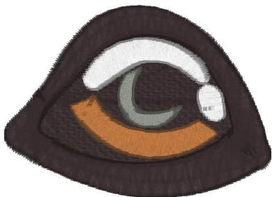
Horse Deer Eyes 19122023 2 Inch.vip 1.98x1.43 inches; 3,001 stitches 4 thread changes; 4 colors