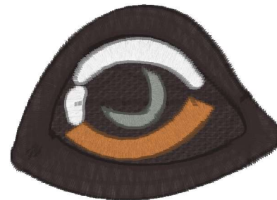
Horse Deer Eyes 19122023 2 Inch R.vip 1.98x1.43 inches; 3,001 stitches 4 thread changes; 4 colors