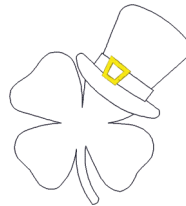
Shamrock With Hat - Bean - Ata - 8x8.vip

5.85x6.50 inches; 3,522 stitches 10 thread changes; 4 colors