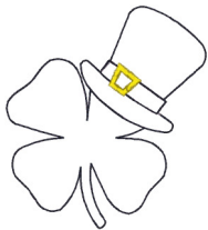
Shamrock With Hat - Bean - Ata - 4x4.vip

3.46x3.85 inches; 2,179 stitches 10 thread changes; 4 colors