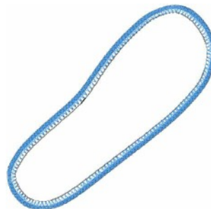
M 1612 $ vip 7.50x7.40 inches; 7,307 stitches 4 thread changes; 4 colors