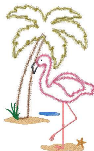
Flamingo And Palm Tree A.vip 9.40x15.08 inches; 30,994 stitches 22 thread changes; 18 colors