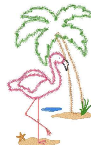
Flamingo And Palm Tree B.vip 9.40x15.08 inches; 31,051 stitches 21 thread changes; 15 colors