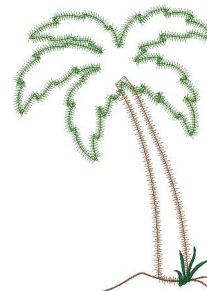
Palm Tree B.vip 8.57x12.16 inches; 12,994 stitches 8 thread changes; 7 colors