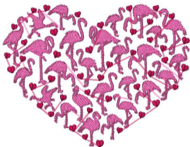
T1847 Flamingo Heart.vp3 3.78x2.87 inches; 14,096 stitches 2 thread changes; 2 colors