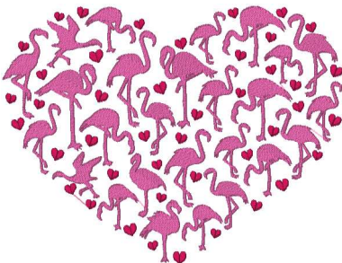
T1847c Flamingo Heart.vp3 8.93x6.78 inches; 39,395 stitches 2 thread changes; 2 colors