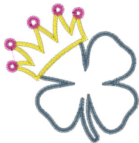
Shamrock With Crown - Zig Zag - Ata - 4x4.vip 3.69x3.85 inches; 3,059 stitches 9 thread changes; 5 colors