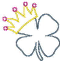
Shamrock With Crown - Zig Zag - Ata - 5x7.vip 4.86x5.06 inches; 3,619 stitches 9 thread changes; 5 colors